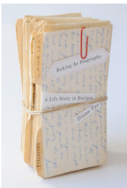
Baking as Biography by Diane Tye

There is a book of readings available at The Campus Store. You are also to choose ONE of the following: