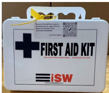
Type 2 – Campus workspaces

Supplies to replenish the kits are available through the OHS Office.