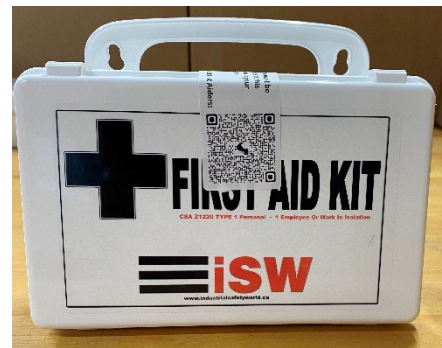
Type 1 – Vehicles